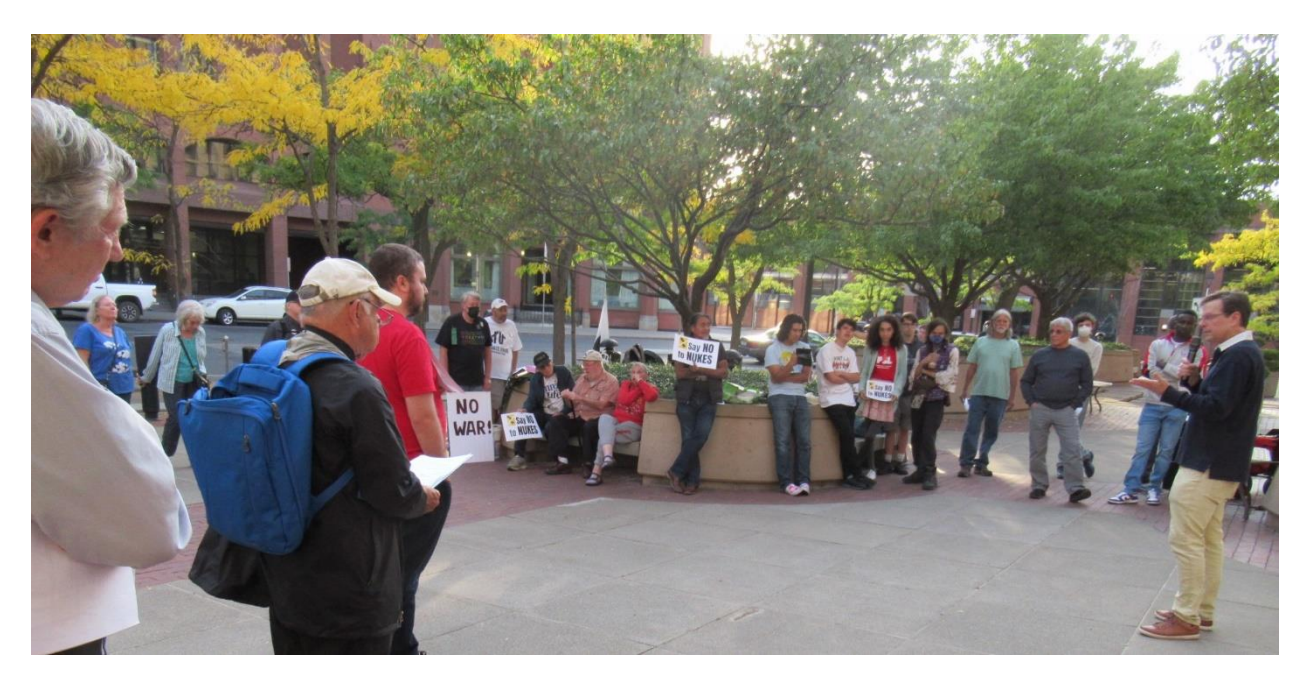
Spokane City Council President Breean Beggs calls for activists with clear core human values to persist.

Beggs announces a first reading and testimony for passage of a Spokane City Council Ordinance declaring our city a Nuclear Weapons Free Zone on October 24<sup>th</sup>, with a vote on November 7, 2022.