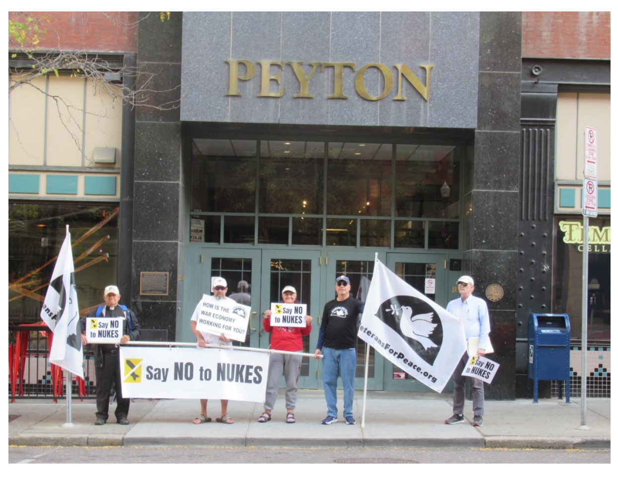
Spokane Veterans For Peace Picket at Senator Murray and Representative McMorris-Rodgers' offices.